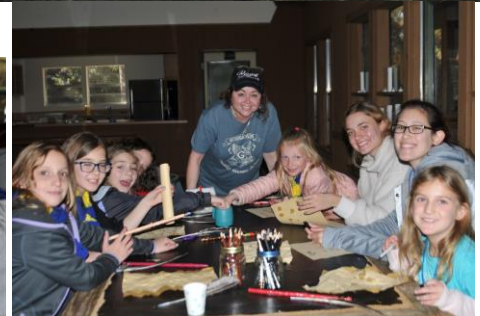
Defense Against Darkness