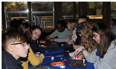
Care of Magical Creatures